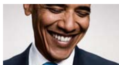
Interview: After the Primaries by Jann S. Wenner (July 2008)

The recovery package we shaped was put together on the theory that we shouldn't exclude any ideas on the basis of ideological predispositions, and so a third of the Recovery Act were tax cuts. Now, they happened to be the most progressive tax cuts in history, very much geared toward middle-class families. There was not only a fairness rationale to that, but also an economic rationale — those were the folks who were most likely to spend the money and, hence, prop up demand at a time when the economy was really freezing up.