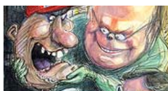
Matt Taibbi: The Truth About the Tea Party