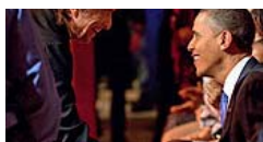
Audio Excerpts: Obama on Dylan and McCartney at the White House