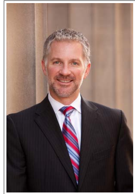
Robert Shelby was confirmed by the U.S. Senate in 2012 as a federal judge in Utah.

"We cannot capture in words the gratitude and joy plaintiffs feel that Judge Shelby had the courage to declare, as the United States Constitution requires, that same-sex couples, like all other U.S. citizens and Utah residents, are constitutionally entitled to marriage equality in Utah."